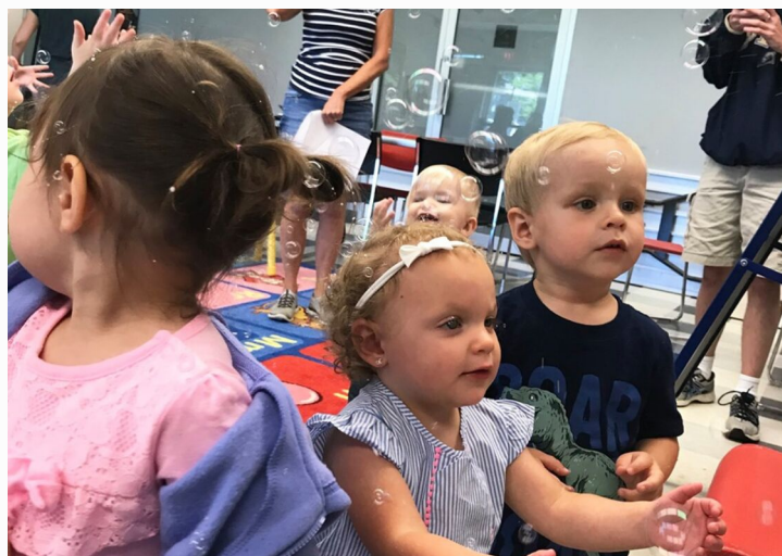
*Tot Time June 2019