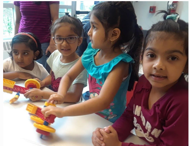
*Snapology Program June 2019