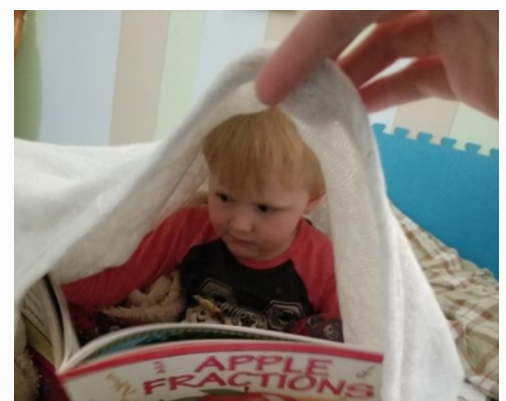
*"Get Caught Reading" Facebook Challenge