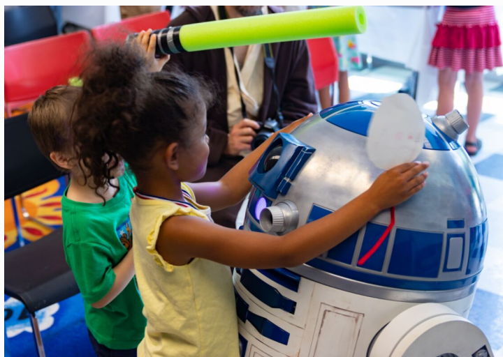
*Star Wars Day 6/29/19