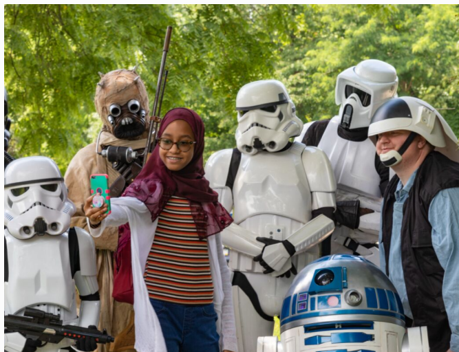
*Teen After School Program - Virtual Reality