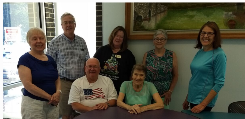
*Wise Walk June 2019

~ New and Featured Large Print, Audio, and DVDs