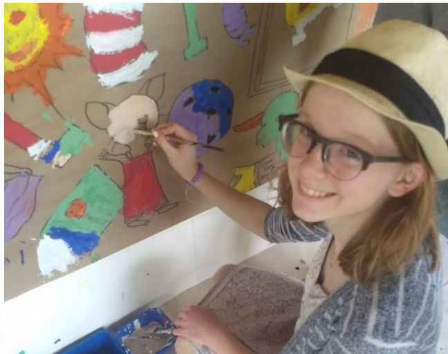
*Art in the Park June 2019