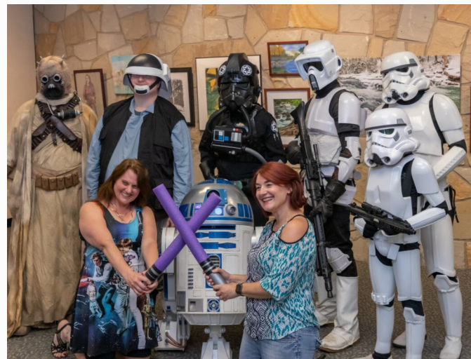
*Teen After School Program - End of Year Celebration