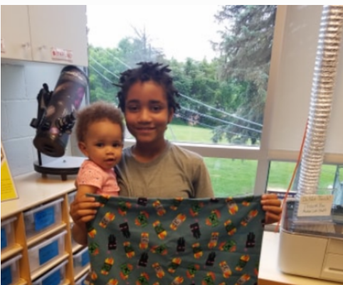
*Teen Program End of Year Celebration