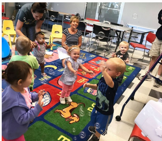
*Tot Time June 2019

Pride Month Display: Though there were some patrons who expressed concern about our Pride display for the month of June, far more went out of their way to thank us and express how much they appreciated us having a display for Pride month. Several parents approached staff and commented that they never knew there was this many children's books about LGBTQ topics and they never would have thought of using books to expose their children to the topic.