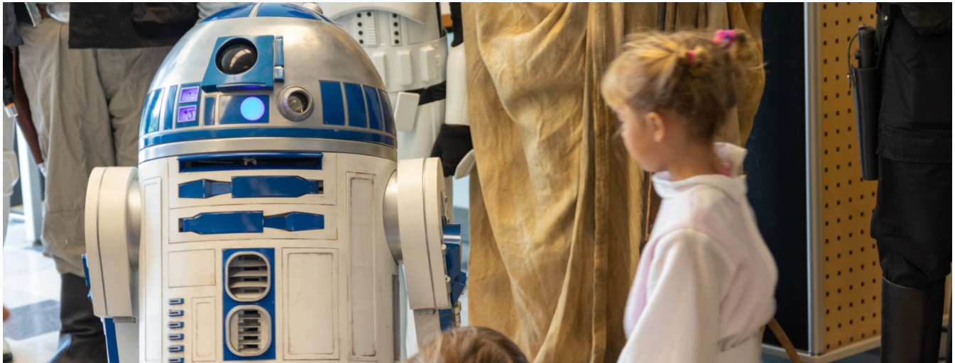
*Star Wars Day 6/29/19