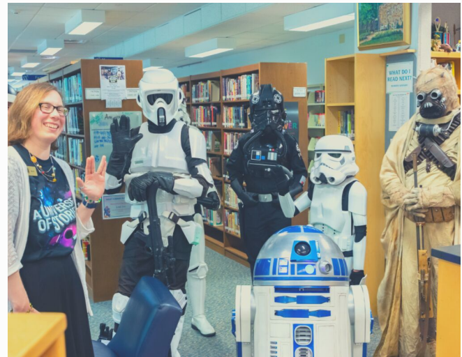
Star Wars Day 6/29/19